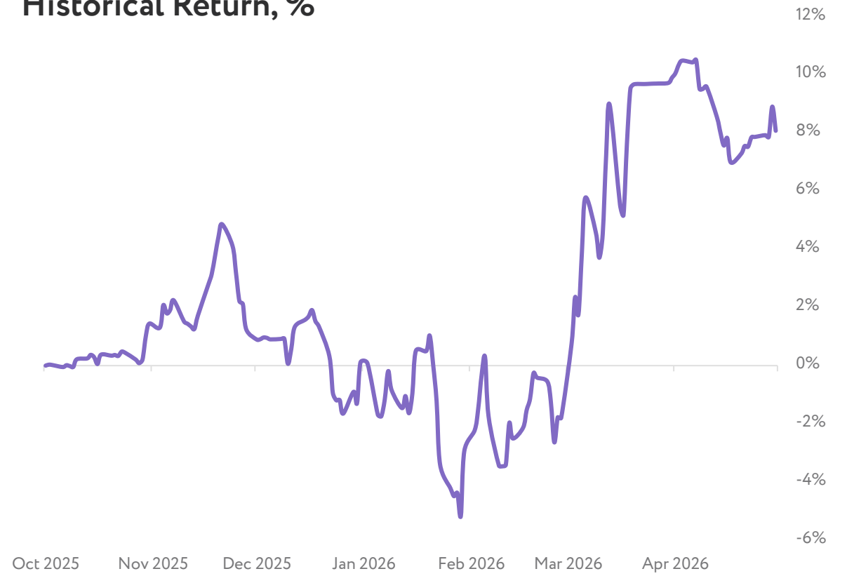
Historical Return, %