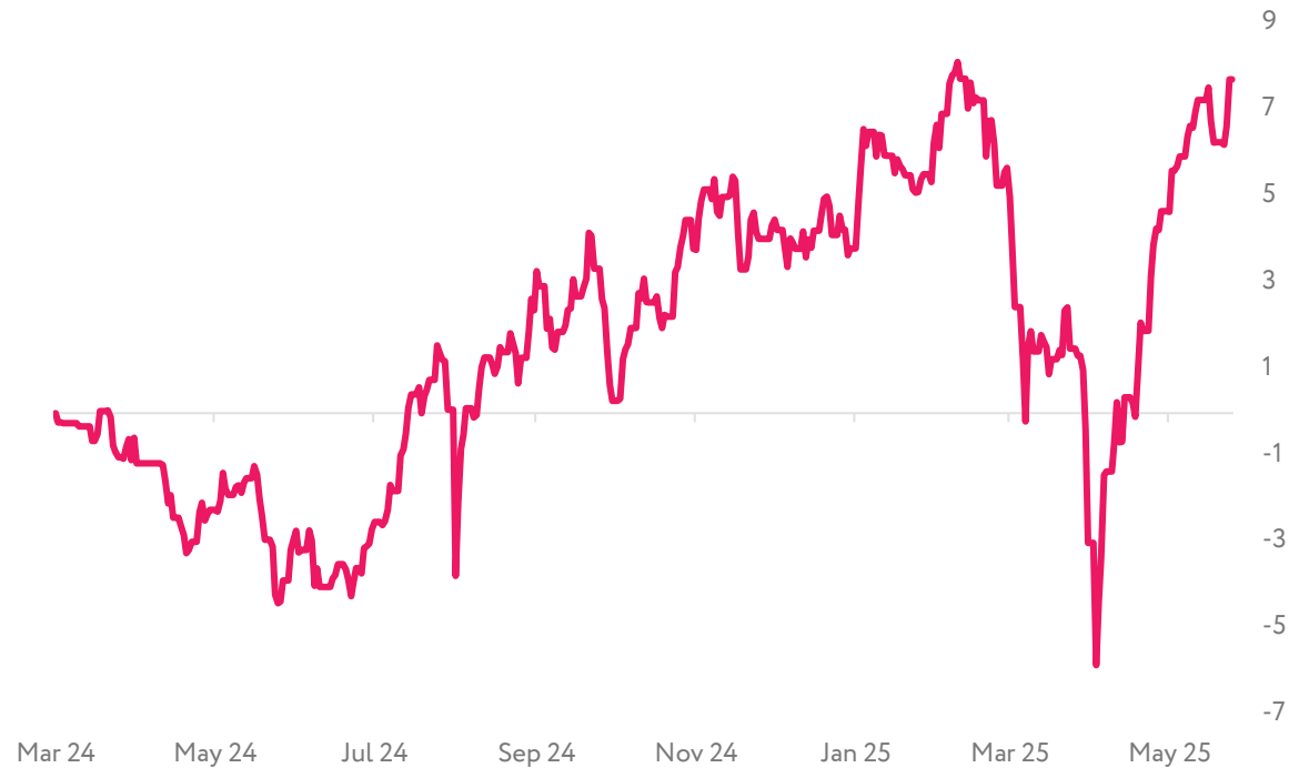
Historical Return, %

The strategy net return as of May 29, 2025