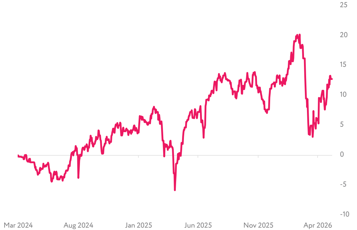
Historical Return, %